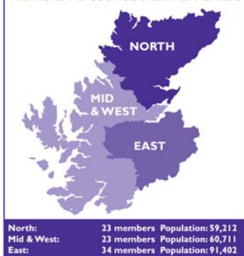
THE HIGHLAND COUNCIL OPERATIONAL AREAS